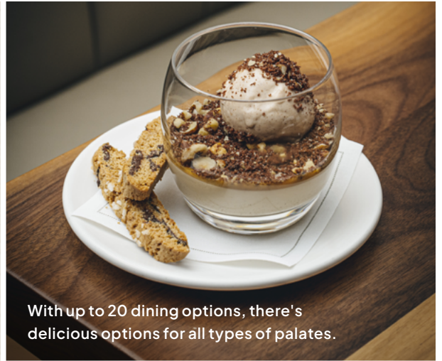
With up to 20 dining options, there's delicious options for all types of palates.