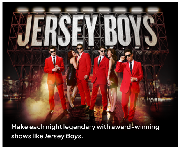
Make each night legendary with award-winning shows like Jersey Boys.