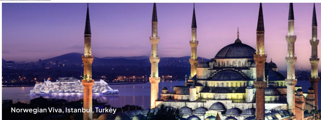
Norwegian Viva, Istanbul, Turkey