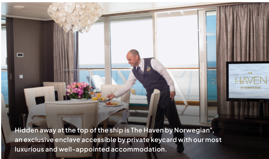
Hidden away at the top of the ship is The Haven by Norwegian®, an exclusive enclave accessible by private keycard with our most luxurious and well-appointed accommodation.