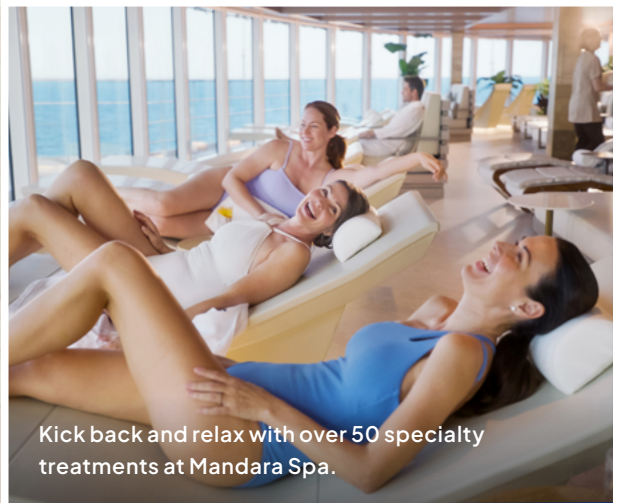
Kick back and relax with over 50 specialty treatments at Mandara Spa.