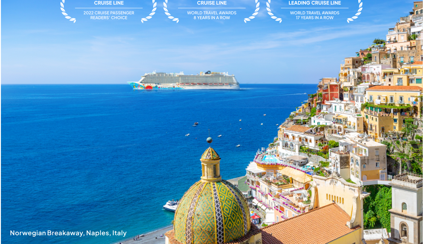
Norwegian Breakaway, Naples, Italy