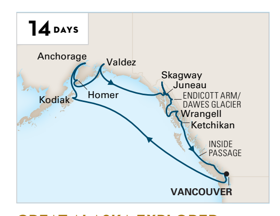
GREAT ALASKA EXPLORER

Uncover Alaska's popular ports and hidden gems on this two-week journey of discovery. Spend time exploring the Last Frontier's largest and capital cities as well as less-traveled wonders including Endicott Arm Fjord and the "Halibut Fishing Capital of the World," Homer.