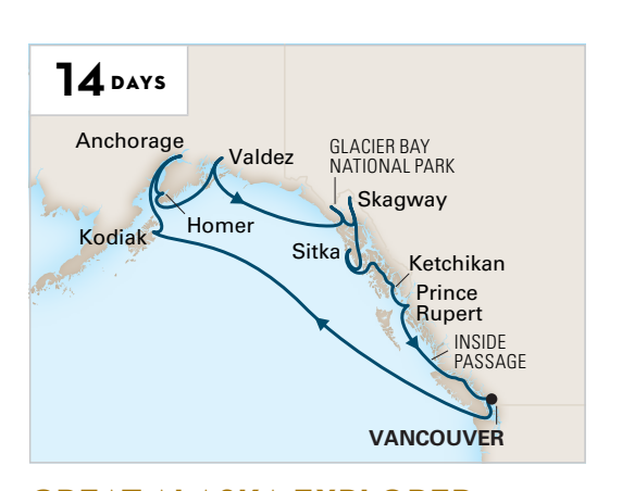
GREAT ALASKA EXPLORER