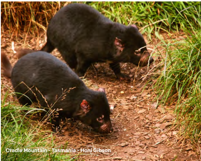
Cradle Mountain - Tasmania - Honi Gibson